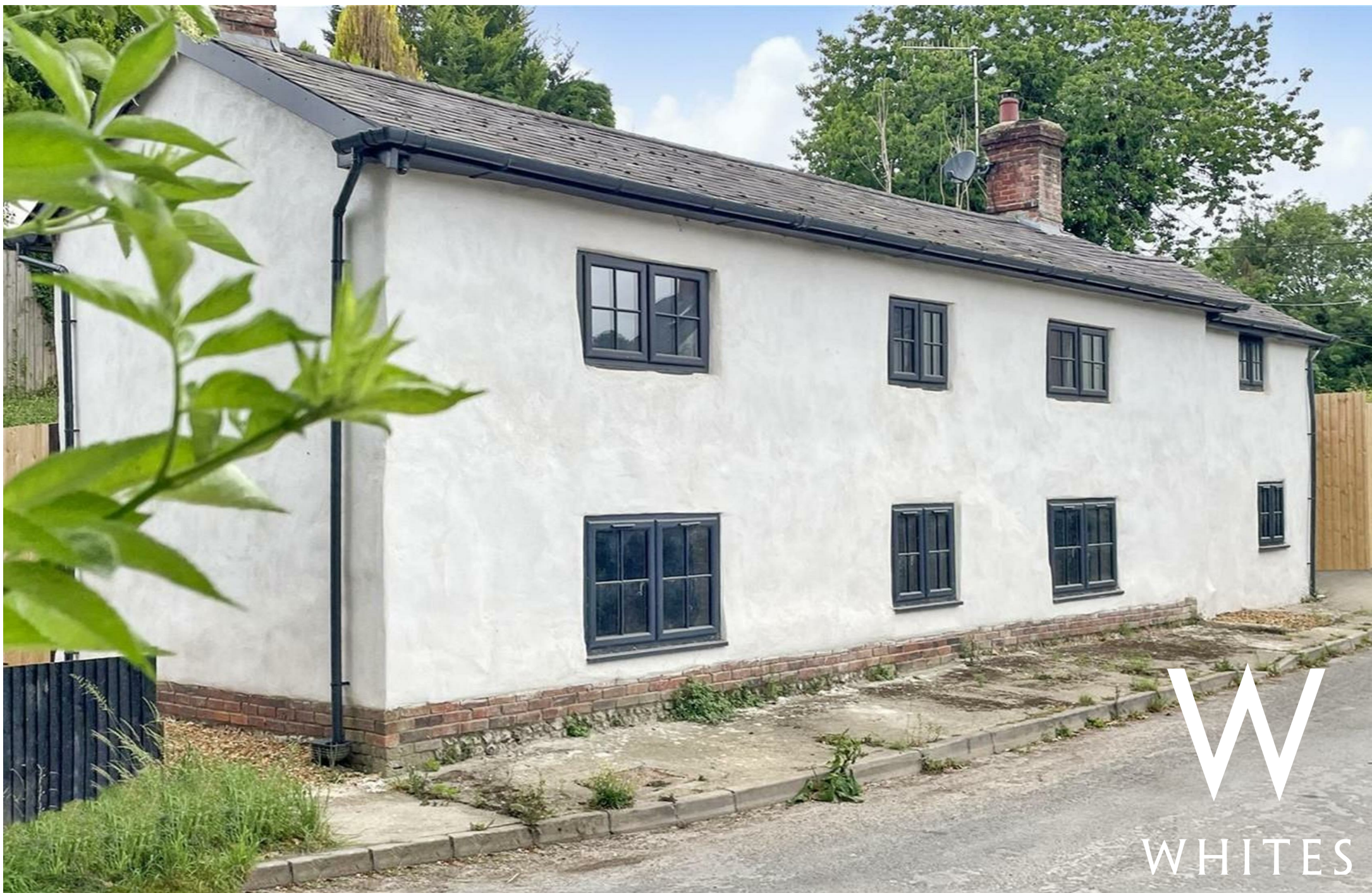
Sava Cottage, 2 Chine Road, Upper Woodford, Salisbury, Wiltshire, SP4 6NX